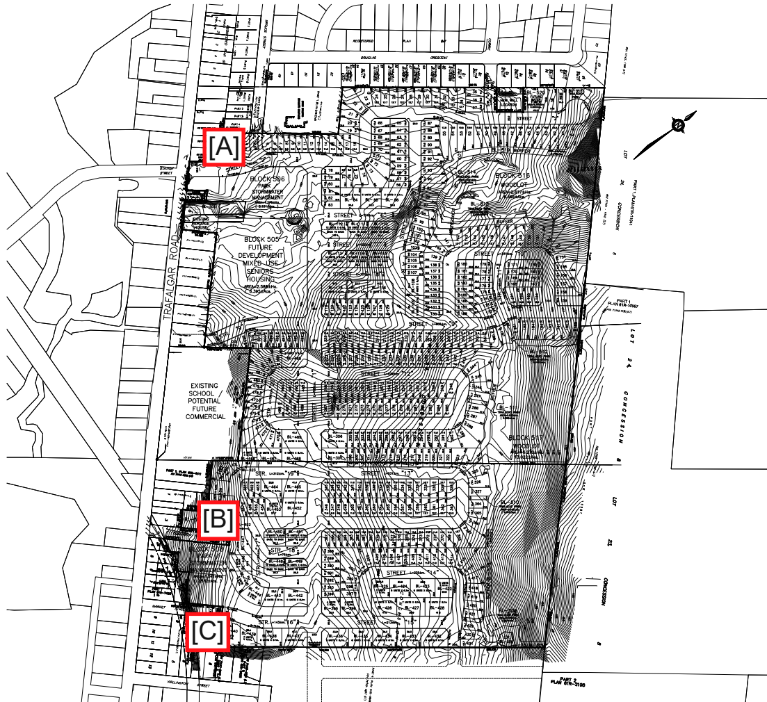
Figure 2: Proposed Site Plan Showing Prediction Locations

DRAFT PLAN OF SUBDIVISION PART OF LOTS 23 AND 24, CONCESSION 8 (GEOGRAPHICAL TOWNSHIP OF ERIN) PART OF LOTS 11 & 12 EAST OF MARKET STREET, PART OF LOT 14 ALL OF LOTS 15 & 16 WEST OF MARKET STREET, PART OF LOTS 4 AND 17, ALL OF LOTS 18, 19 AND 20, EAST OF GUELPH STREET, PART OF LOTS 21 & 22, ALL OF LOTS 23 & 24, WEST OF GUELPH STREET, REGISTERED PLAN 95 (FORMERLY VILLAGE OF HILLSBURGH) NOW IN THE TOWN OF ERIN COUNTY OF WELLINGTON SCALE 1:2000