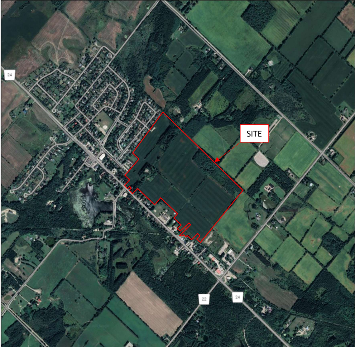
Figure 1: Key Plan