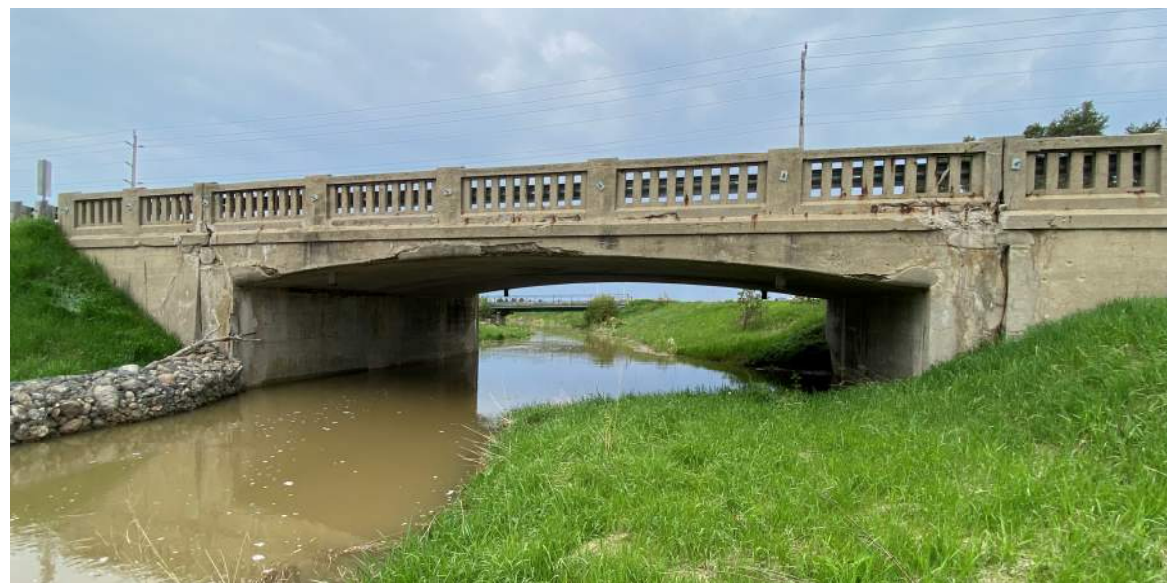
Conestogo River Bridge # 4, B109133