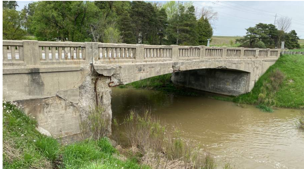
Conestogo River Bridge # 6, B109132