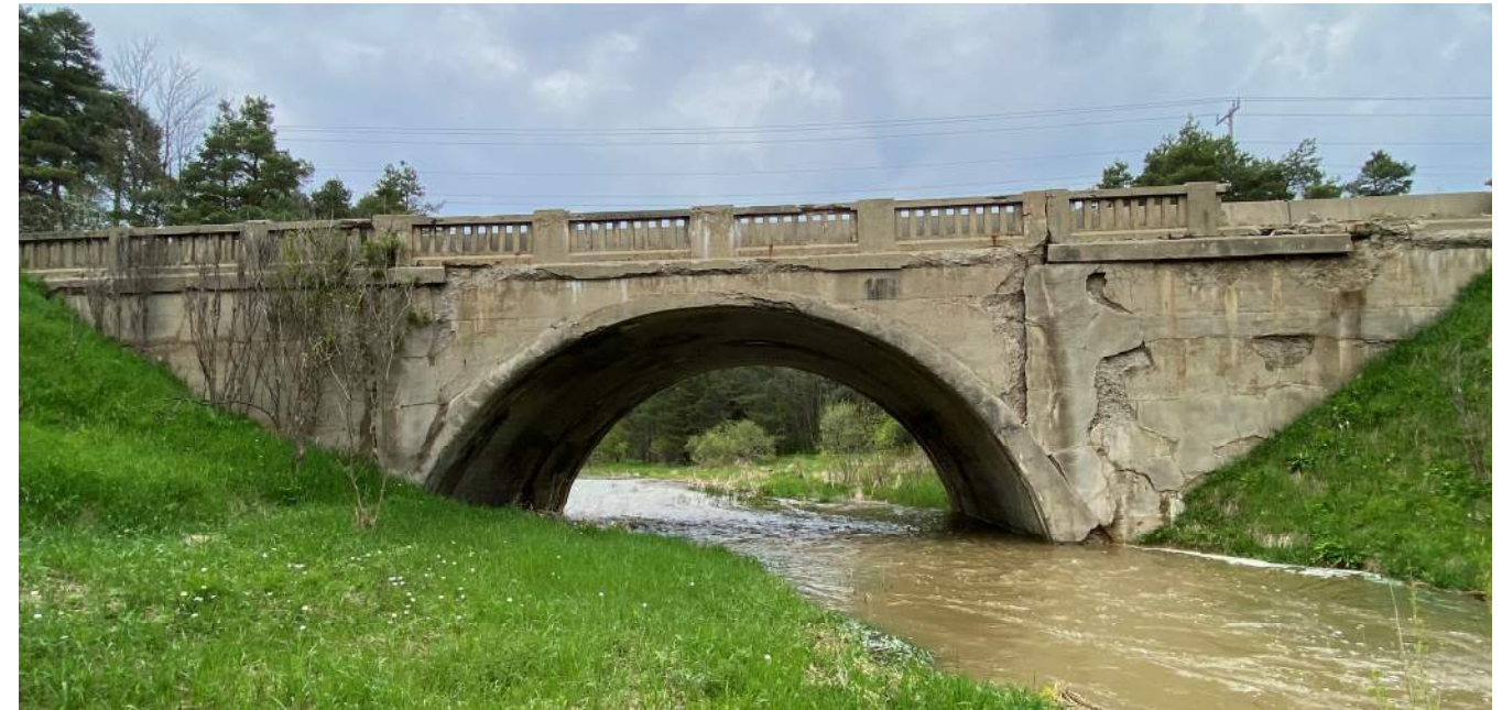
Conestogo River Bridge # 5, C109123